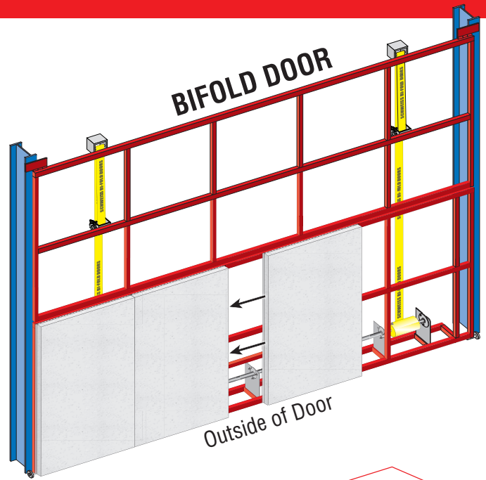
Illustration showing how the insulation panels fit together.